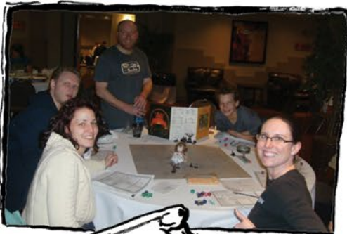
Genghis Con Denver, CO