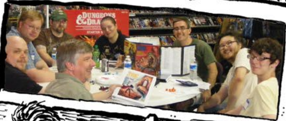
DiceHead Games Cleveland, TN