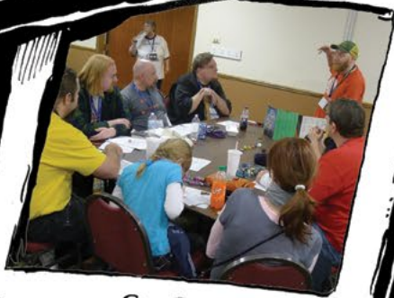
GaryCon Lake Geneva, WI