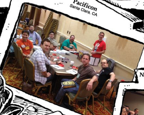
Pacificon Santa Clara, CA