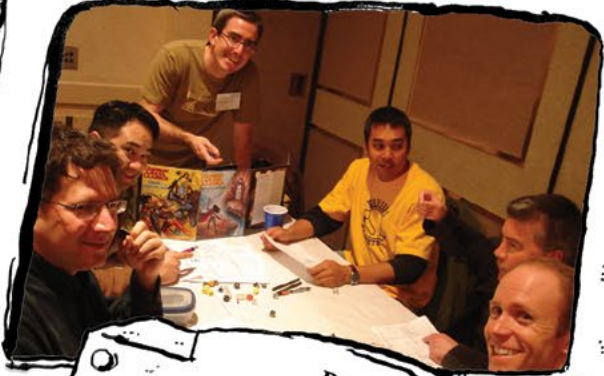
DunDraCon San Ramon, CA